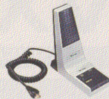
MD-11A&J Desktop Microphone