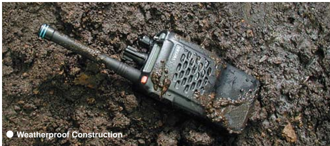
● Weatherproof Construction

Built to meet or exceed the requirements of the U.S. MIL-STD 810 C/D/E standard, the VX-800 is designed to survive under difficult operating conditions of shock, vibration, and driving rain. Cost-performance begins with durability, and the Mil-Spec toughness of the VX-800 is your guarantee of its design quality.