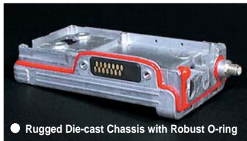
● Rugged Die-cast Chassis with Robust O-ring

The VX-800's ruggedness begins with its one-piece die-cast aluminum chassis, which provides high strength and durability along with light weight. Surrounding the portable's circuitry is a one-piece high-impact case, sealed against water ingress by a robust O-ring.