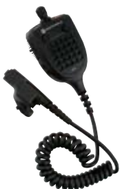
GPS Remote Speaker Microphone

Features the latest in voice processing technology. Listen and speak under the most adverse conditions. Miniaturized system fastens snugly to the ear.