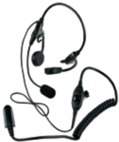
Temple Transducer Headset

Large selection of IMPRES batteries are available in various chemistries.