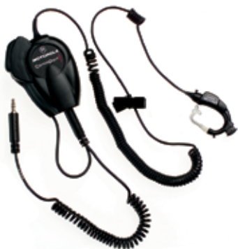
CommPort™ Integrated Microphone/Receiver

It's easy to operate and integrate into any system, and works well with your current XTS and MTS accessories.