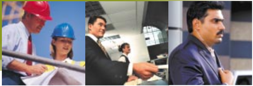
Compact and rugged, the GP328 Plus and GP338 Plus are ideal for professional on the go.