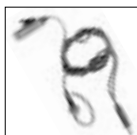
BDN6667 (Biege) 2-wire surveillance