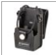
** PMLN4471 Hard Leather Case with Swivel Clip