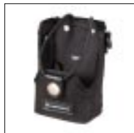
** PMLN4470 Nylon Case with Swivel Clip