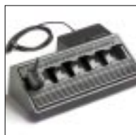
PMTN4028 Multi-Unit Rapid Charger