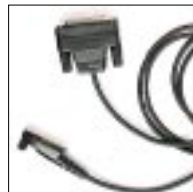
JMKN4123 Programming Cable