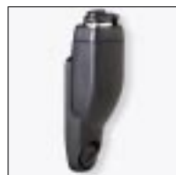
PMLN4455 Accessory Adaptor