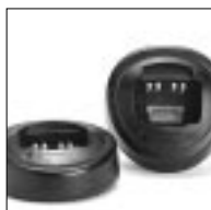
PMTN4025 Single Rapid Charger