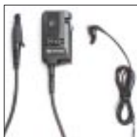
JMMN4064 VOX/PTT Interface Module shown with BDN6768 Ear Microphone