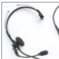
JMMN4066 Lightweight Headset with Boom Mic