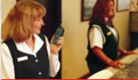
For Restaurants and Hotels