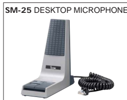
SM-25 DESKTOP MICROPHONE Convenient for dispatching, equipped with monitor switch.