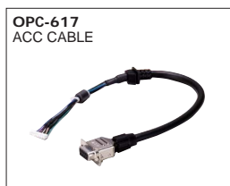
OPC-617 ACC CABLE For external connection such as dimmer control, PTT control, horn drive, etc.