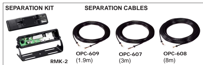
SEPARATION KIT SEPARATION CABLES RMK-2 : For front panel detachment installation. OPC-609 : 1.9m Separation cable for use with the RMK-2. OPC-607 (3m) and OPC-608 (8m) cables are EMC non-compliant. Not available in EU countries.