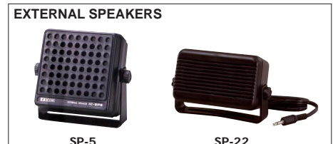
EXTERNAL SPEAKERS SP-5 : Large speaker for good audio quality. SP-22 : Compact and easy-to-install. Same as supplied with the IC-F1810/F2810.