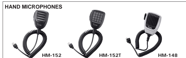
HM-152 : Regular microphone. Same as supplied. HM-152T : DTMF microphone. HM-148 : Dynamic (moving coil) microphone for heavy duty use.

Some options may not be available in some countries. Please ask your dealer for details.