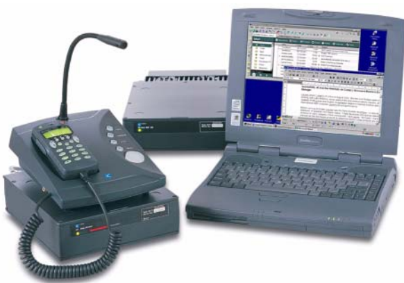
3012 HF Data Modem, NGT desk console, NGT RF Unit and computer

A front panel LED indicator shows presence of power and modem link status.